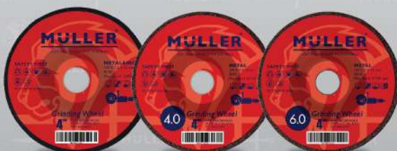
4 GRINDING WHEEL