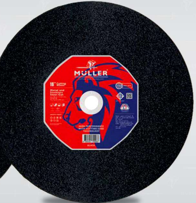
16 CUTTING WHEEL