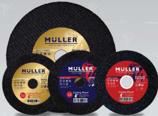
4"-7" CUTTING WHEEL