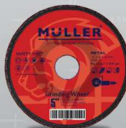
5 GRINDING WHEEL