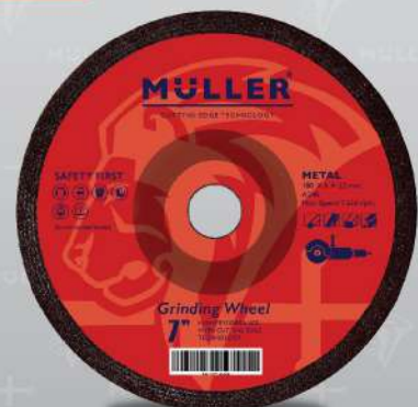
7 GRINDING WHEEL