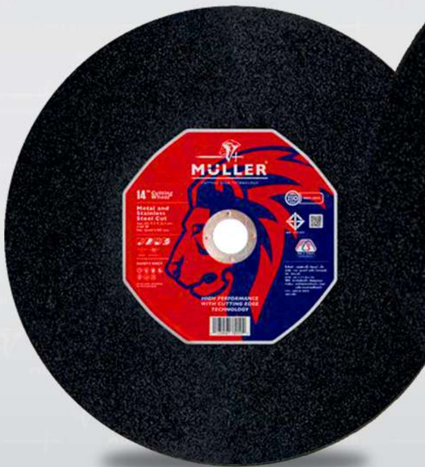
14 CUTTING WHEEL