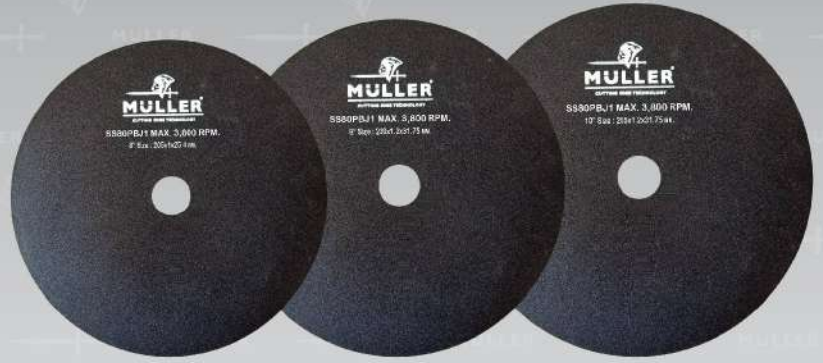
7"-16" CUTTING WHEEL